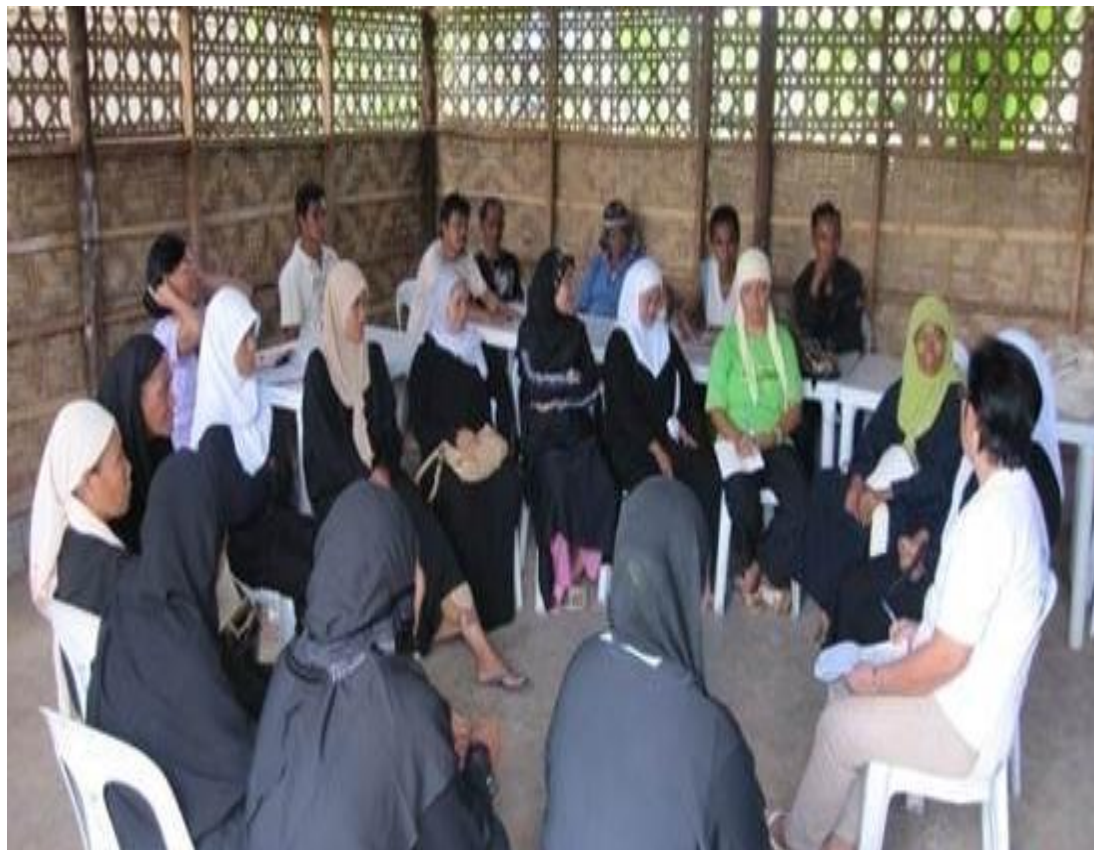
Children and parents consultation: Focus group discussion with parents of pupils held at Shariff Aguak .