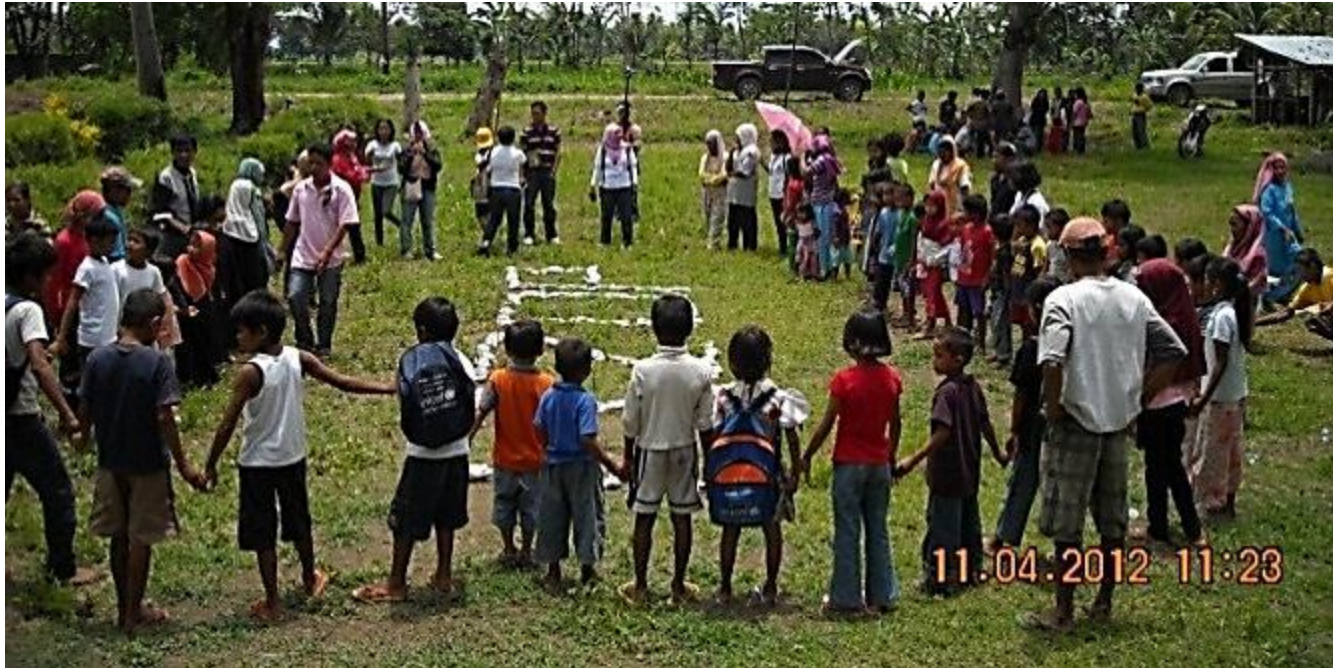
Psychosocial activities: Liong Elementary School pupils gather for therapeutic play and art activities