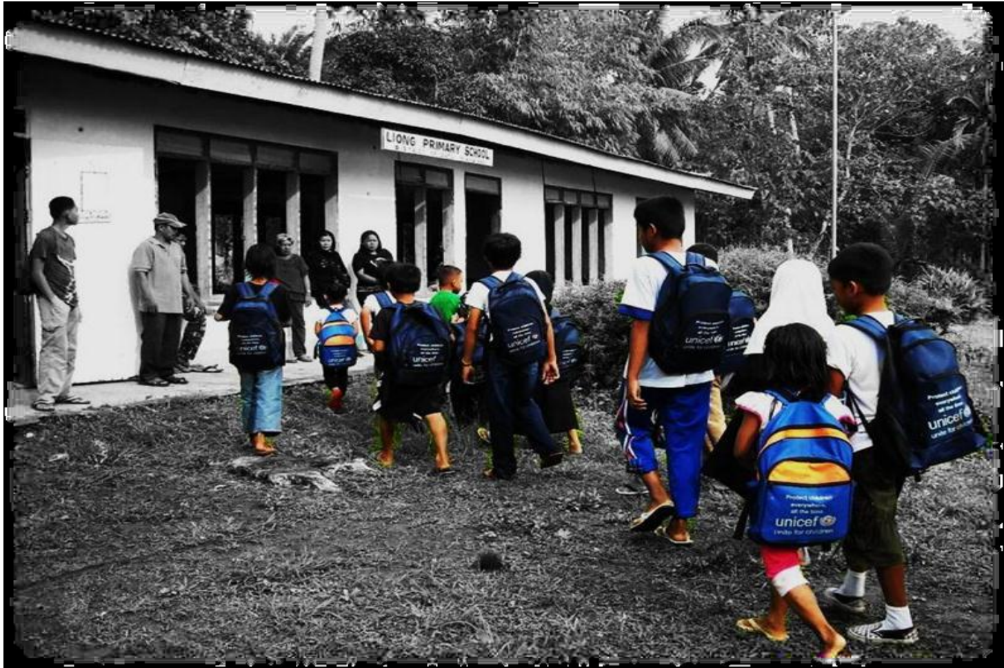
Reopening of Liong Elementary School, Datu Piang Municipality