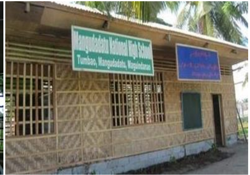
Repair of school house: The Mangudadatu National High School before the repair and after the repair